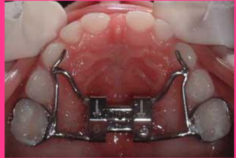
Mea (espansore rapido palatale)