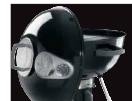
Lid Hanger (comes standard)