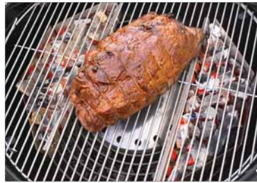
Charcoal Baskets 67400