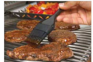
Silicone Basting Brush - 14" 70018