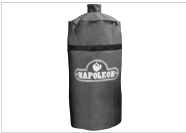
AS300K Apollo® Grill Cover 63900