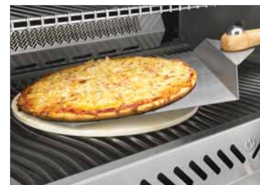
Pizza Spatula 70003