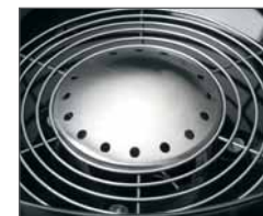
Stainless Steel Heat Diffuser