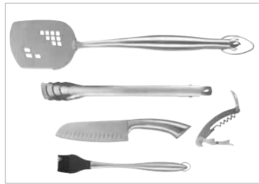
Professional Five Piece Toolset 70011