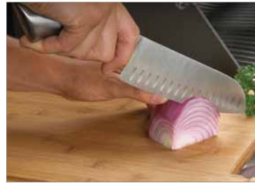
Chef's Knife 55207