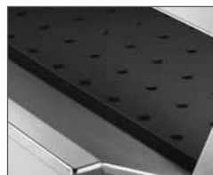
Charcoal Access Door