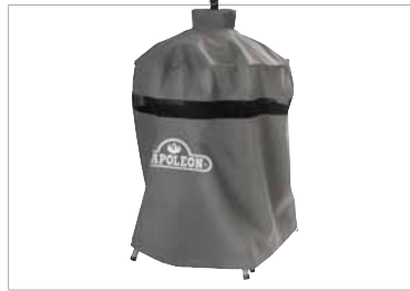
Kettle Leg Grill Cover 63910