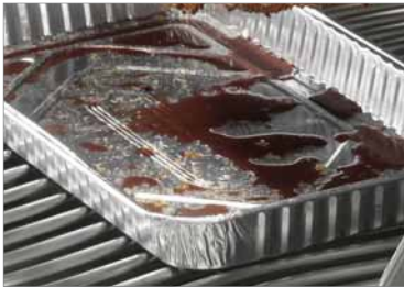
Large Drip Trays 62008