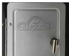
Easy Access Doors