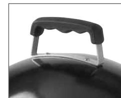
Sturdy Lid Handle