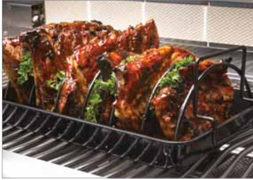
3 in 1 Non-Stick Rib/Roast Rack 56011