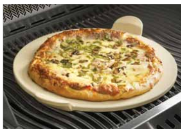
Pizza Set with Stone & Wheel 70001