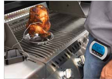
Wireless Thermometer 70006