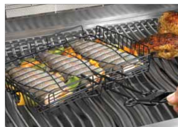
Multi-Grill Basket 57010