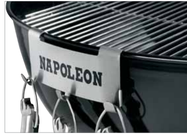
Charcoal Kettle Tool Hanger 55100