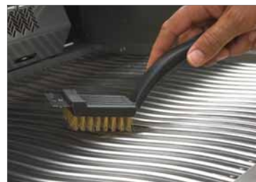
Grill Brush with Scraper - 10" 62010