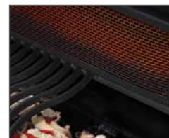
Rear Charcoal Rotisserie Burner