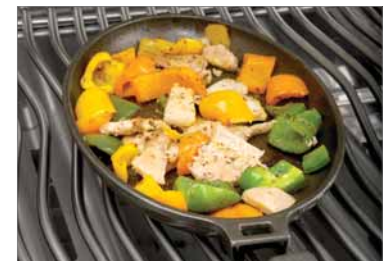
Professional Cast Iron Skillet 56003

Visit napoleongrills.com to see Napoleon's complete line of grilling accessories.