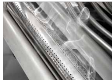
Smoker Pipe 67011