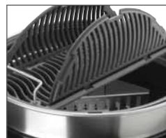
Hinged Cooking Grids Three Height Adjustments