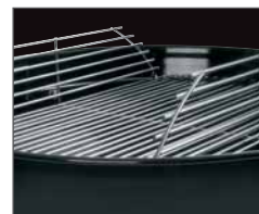
Hinged Cooking Grids