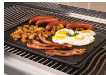
Cast Iron Griddles