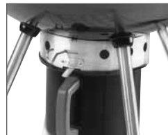
Removable Heavy Steel Ash Catcher