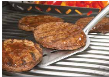
Professional Spatula 70010