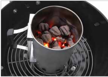
Charcoal Starter 67800