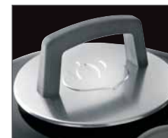
Cool Touch Handle