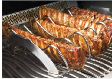
Stainless Steel Rib & Roast Rack 70009