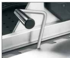
Adjustable Charcoal Bed