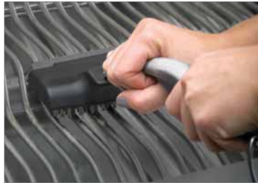
Stainless Steel Grill Brush 62035