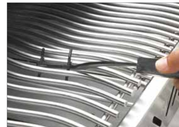
Grid Lifter 62121