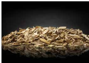
Wood Chips Mesquite, Maple, Hickory, Cherry, Apple

Place wet wood chips into the smoker tube and place over the left burner, then turn the burner on. Place your meat over the right burner, but do not turn on that burner. You are using the indirect cooking method. Smoke the meat for several hours under a closed lid. To achieve maximum flavour, fresh wood chips may be added several times during the cooking process.