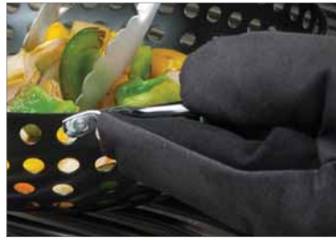
Heat Resistant Gloves 62140