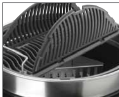
Hinged Cooking Grids