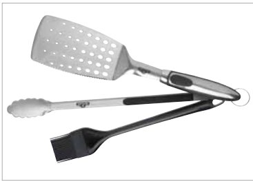
Three Piece Toolset 70019