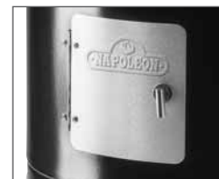
Easy Access Doors