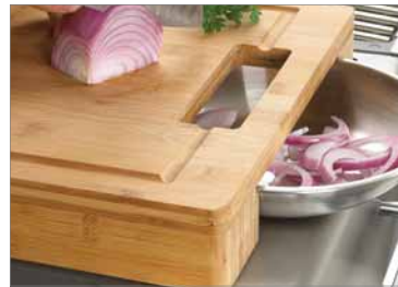
Professional Cutting Board Set 70012