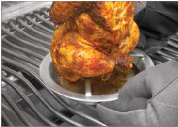
Stainless Steel Chicken Roaster 56021