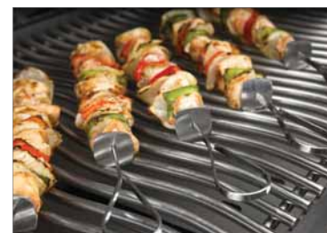
6 Stainless Steel Skewers - 14" 70016

Visit napoleongrills.com to see Napoleon's complete line of grilling accessories.