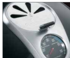
ACCU-PROBE™ Temperature Gauge