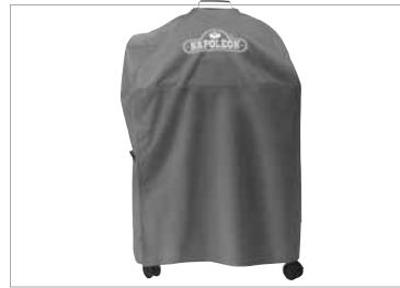
Kettle Cart Cover 63911