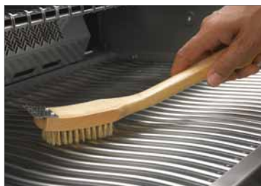
Brass Grill Brush - 18" 62028