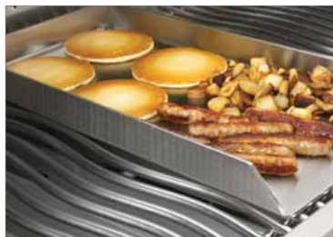
Stainless Steel Griddles