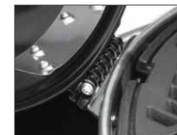
Ergonomic Hinged Lid