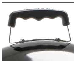
Sturdy Lid Handle