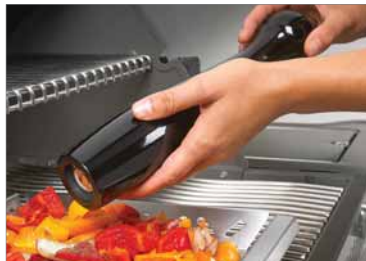
Pepper Grinder 70004