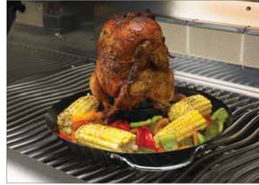
Wok & Beer Can Chicken Roaster 56020