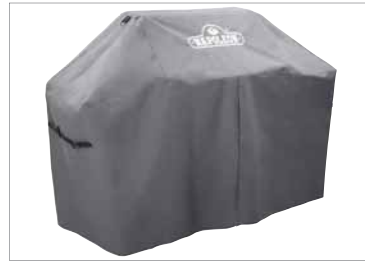
605 Series Heavy Duty Grill Cover 63605