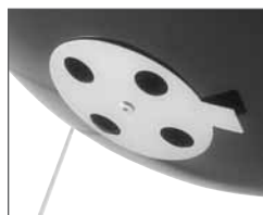
Temperature Control Vent