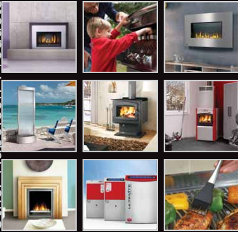
Fireplace Inserts • Charcoal Grills • Gas Fireplaces • Waterfalls • Wood Stoves Hybrid Furnaces • Electric Fireplaces • Heating & Cooling • BBQ Accessories