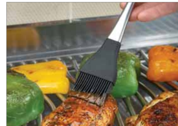
Stainless Steel Silicone Brush 55005