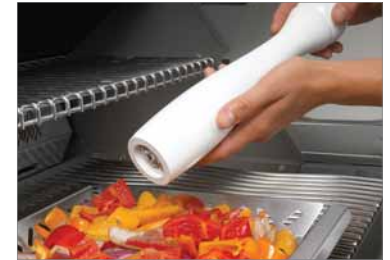
Salt Grinder 70005